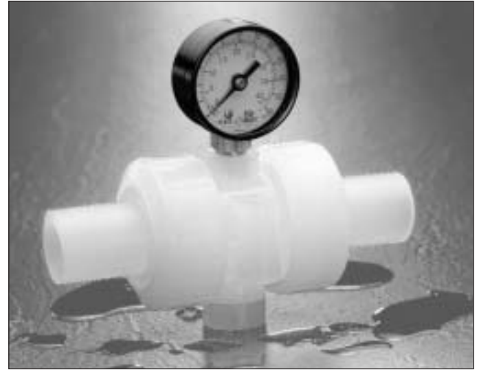
GGMU above, shown with Schedule 80 male spigot ends for fusion (Code C3 below) and standard 2" gauge.

Note: 1/4" NPT instrument connection is standard on all Ultra-Pure gauge guards. For other size requirements consult factory.